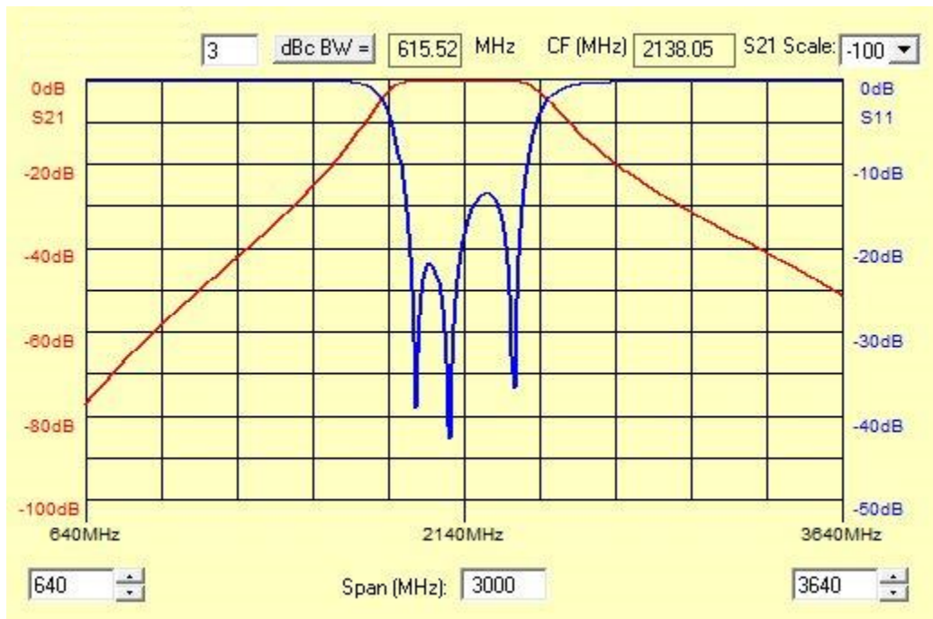
Filter Response Plot